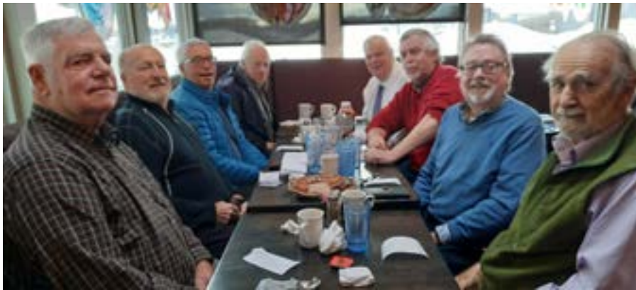
The Men's Breakfast crew enjoy friendship, great discussions, a delicious meal, and they support the Caldwell Family Centre.

With the end of the special COVID-19 funding, the Caldwell Family Centre is facing cuts to programming and services, just as the need is steadily increasing. Please consider sending a letter to Members of Parliament and City Councillors to advocate for more funding. Our city cannot afford for Caldwell to cut its programmes.